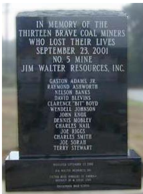
No. 5 Mine Monument

WEST ALABAMA LABOR COUNCIL, AFL-CIO P.O. Box 20264 Tuscaloosa, Alabama 35402 Phone: 205-758-4476 Fax: 205-758-4479 e-mail: walc@uswa351.org web: http://www.westalc.org